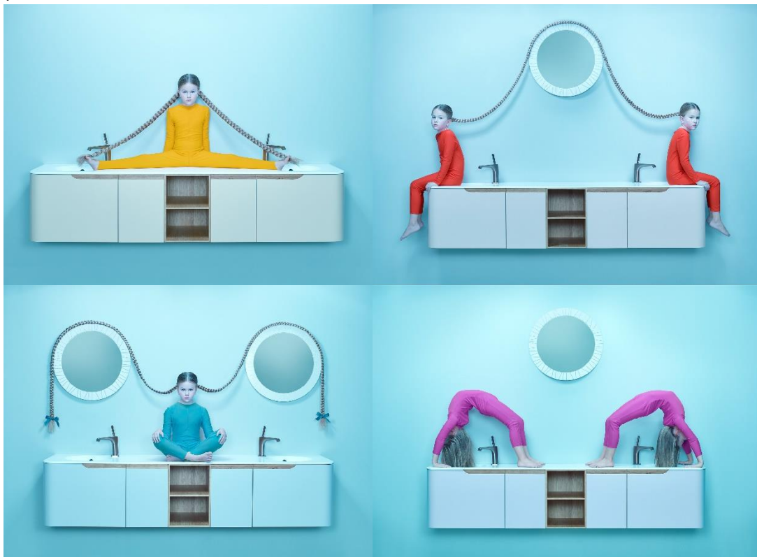
DreamTop furniture and little Eva media campaign