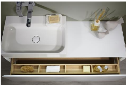
Super-slim drawer bodies

Simple yet artistic products with the high utility value. Sleek curves, bevelled edges, super-slim drawer bodies, water resistant materials.