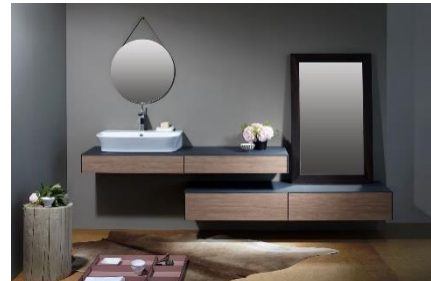
Water resistant satin glass and compact laminate in walnut decor