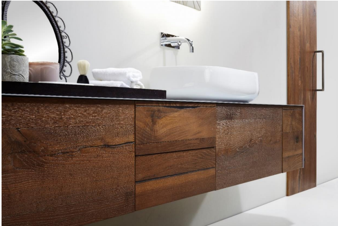
Forever bathroom furniture in oldwood veneer and stainless steel top grey lacquered