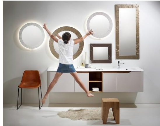
Dream Top in Powder lacquer colour and natural knotted oak veneer