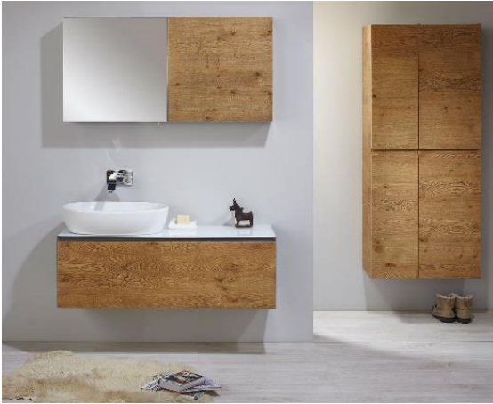
VIPP in vintage knotted oak veneer

Uncompromising in every detail. Beautifully crafted furniture which you will appreciate in your bathroom every day. Bevelled edges allow each piece to fit together perfectly.