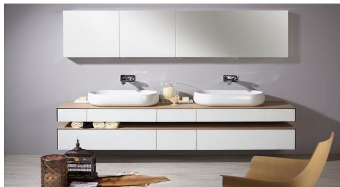
Forever in water resistant compact laminate and satin glass