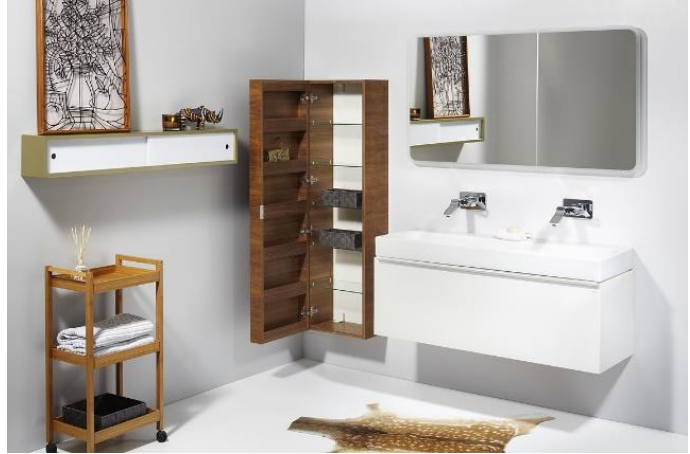
VIPP in white matt lacquer, tall cabinet in natural walnut veneer