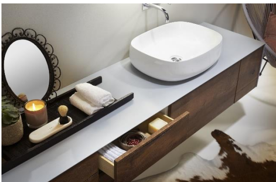
Forever in oldwood veneer and stainless steel top grey lacuered