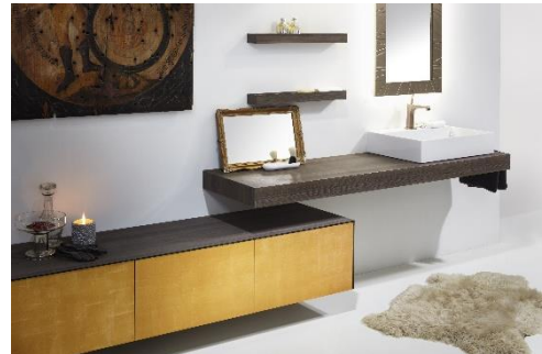
Forever in water resistant compact laminate, Corian top, blue glass and golden Artisan surface